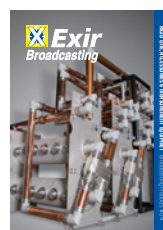
Rigid Line, Accessories & Measurement Equipment