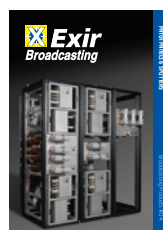
Patch Panels & Splitters