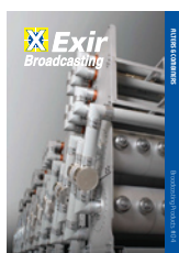
Filters & Combiners