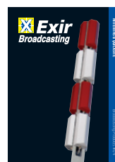
Antennas & QuickSite